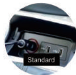
2.5m DC power cord connected to cigarette lighter