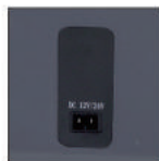
12V/24V Power Plug