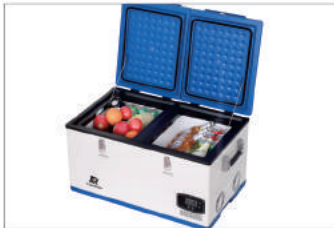
Dual Temperature Control