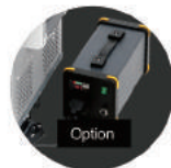
62400mah lithium battery