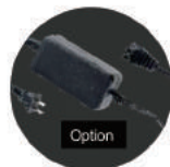
100-240V home use adaptor